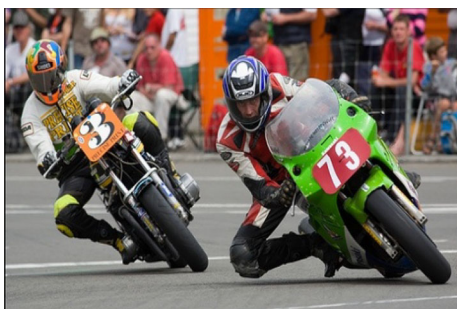
Fig. 1 Motorcycle racing image