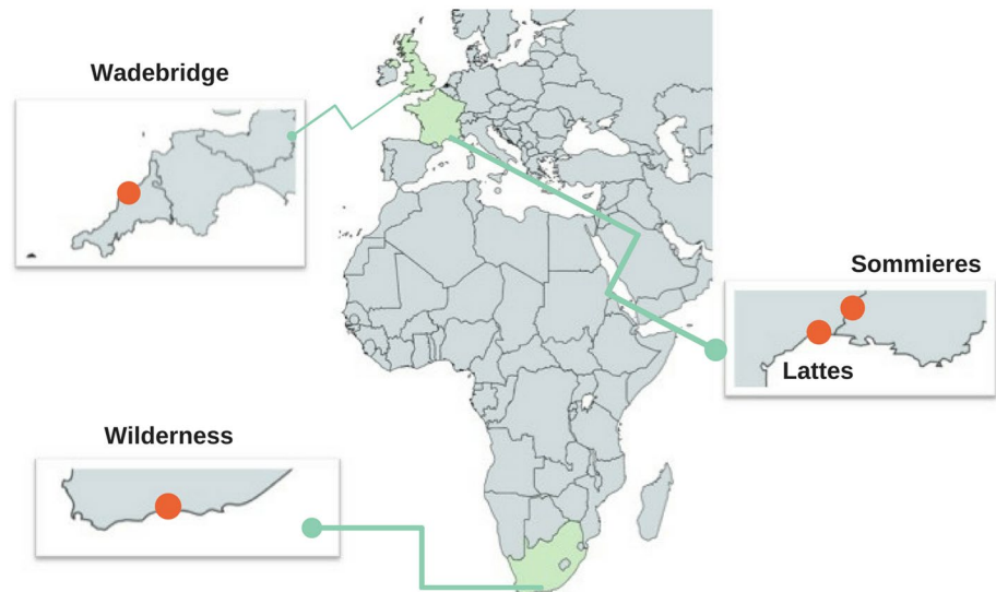
Fig. 1 Location of the four study towns: Lattes (France), Sommières (France), Wilderness (South Africa) and Wadebridge (UK)