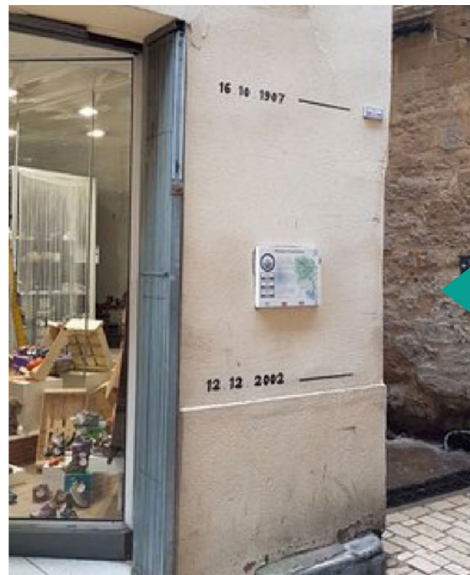
Fig. 4 Signage on wall in central Sommières marking previous flood levels