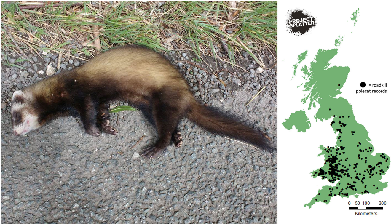
Fig. 3 Roadkill polecat. Physical characteristics of such casualties can be used to determine levels of hybridisation between polecats and feral ferrets, as well as to record their geographical distributions. Inset map

shows distribution of polecat roadkill records in the UK as collated by wildlife-vehicle collision citizen science project 'Project Splatter'