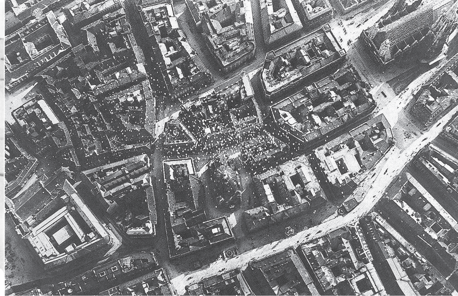
Picture taken over Vienna after dropping leaflets (St. Stephen's Cathedral in the upper right corner)

the squadron has reached their maximum height of 3.650m and is far above the clouds which shields them from any investigating pair of eyes.