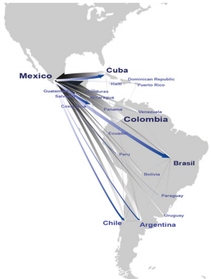
Figure 3: Academic mobility in Latin America and the Caribbean in training of SNI members.