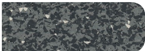
everroll® Granite Marine Mons

Note: The everroll® collection of rubber flooring is made from recycled materials, variations in the shading, EPDM and colour chip dispersion is normal.