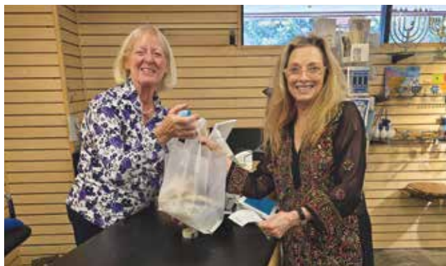
New Traditions' first sale following official reopening

And no time was wasted while closed. Volunteers worked tirelessly for weeks to not only set up shop but to learn a brand new and modernized inventory system. Come in and check it out!