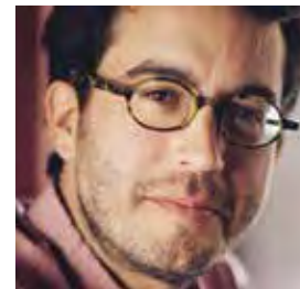
Jonathan Safran Foer

Congregation Emanu El is pleased to welcome Jonathan Safran Foer as our 2023 endowment speaker. Join us for a unique