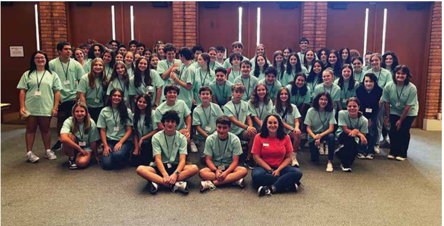
Our 2023-2024 team of TAs!