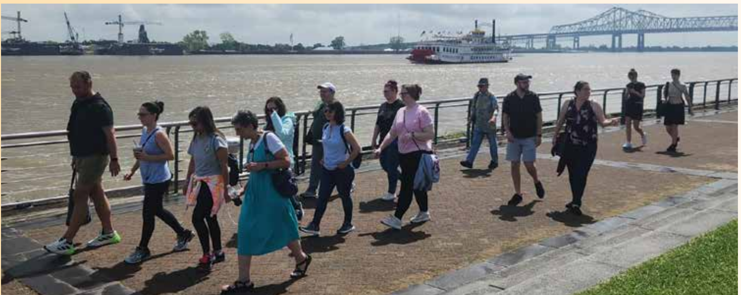
After a fun-filled weekend, the group congregates at Woldenberg Riverfront Park for Havdalah and boat-watching on the Mississippi River.