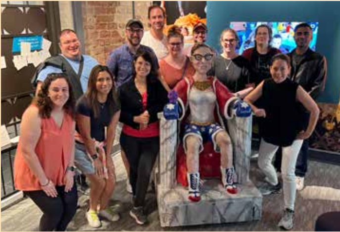
During an educational trip to The Museum of the Southern Jewish Experience (MSJE), the Young Professionals pose with a statue of Ruth Bader Ginsburg.