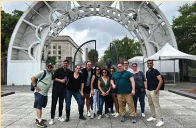
The group spends Shabbat morning Torah Study at the iconic Louis Armstrong Park.