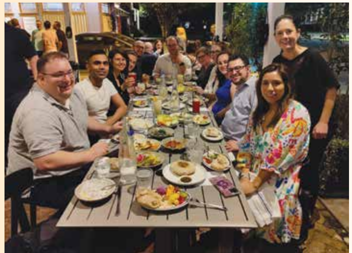
The group celebrates Shabbat with a delicious Israeli feast at Saba.