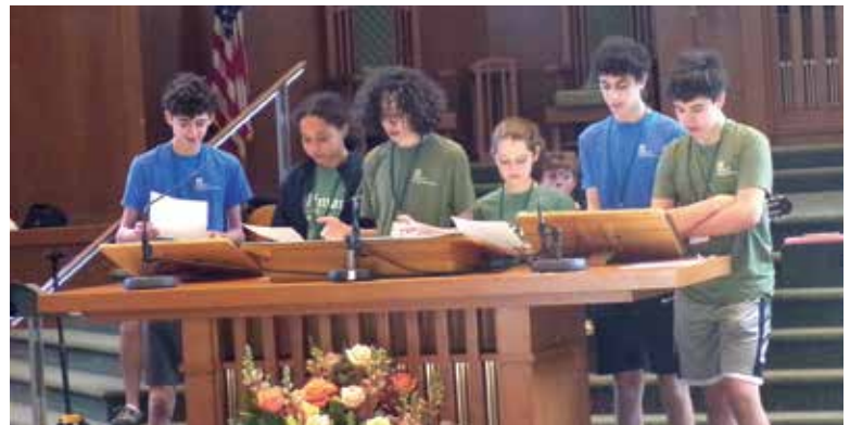
Our Onward Hebrew team introduces the letter of the week in t'filah.