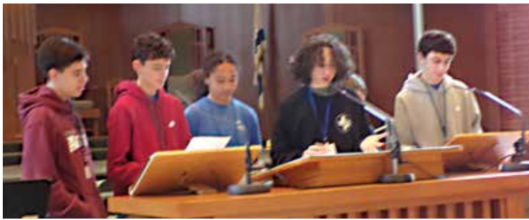
Our song-leading team leads us in morning t'filah.