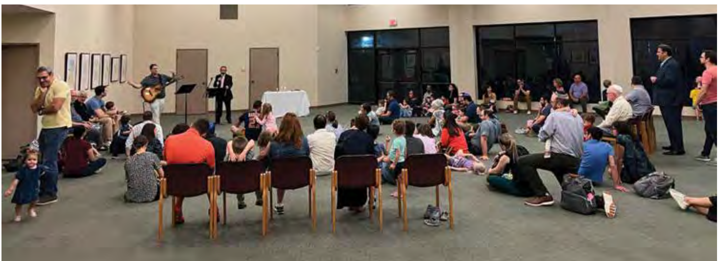
At last month's Tot Shabbat service, families gathered to sing, dance and schmooze after a tasty fajita dinner. In this joyful Shabbat experience our youngest congregants delight in worship through story and song, making lasting memories of time with family and community.