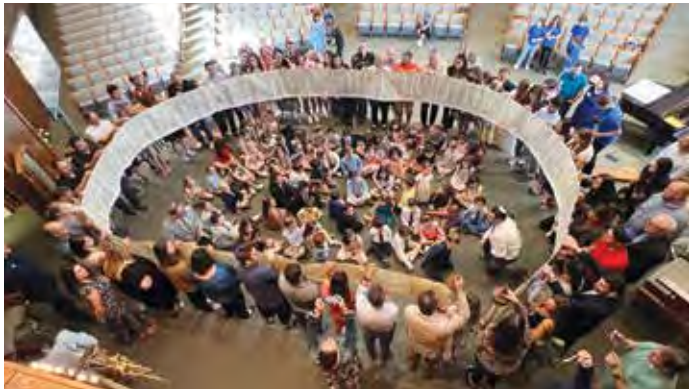
A Torah scroll wrapped all the way around our Consecration students.

It's been a busy fall semester at Helfman Religious School! We've learned about the fall holidays, read Torah stories, learned Hebrew, and enjoyed exploring our lab spaces – movement, art, music, cooking, and STEM. Our newest learners celebrated their Consecration while our Upper School returned to classes ranging from American Jewish history to Jewish ethics – even taking some time to play mah jongg! We can't wait to see what next semester brings!