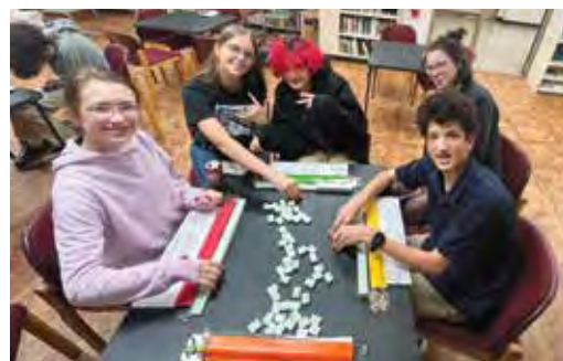
Our Upper School students enjoy a game of mah jongg.