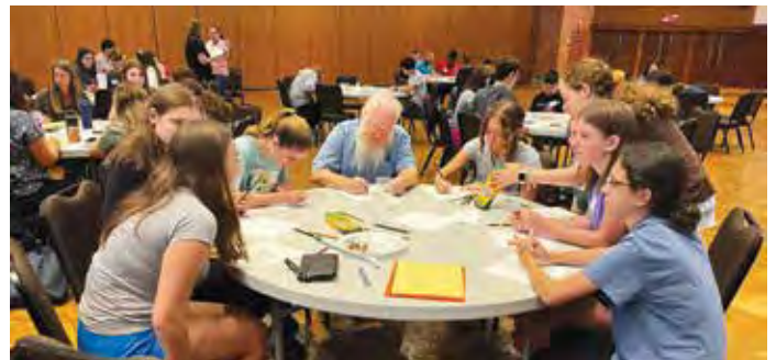
Our teachers and teaching assistants working together to get ready for the school year.