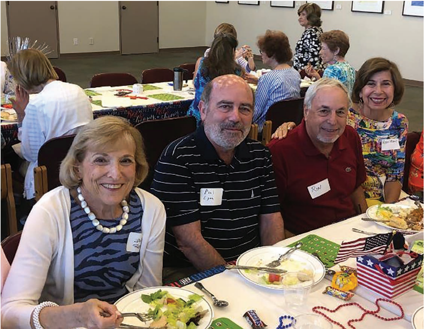
The programming funds over the years have enabled the creation of social groups in the synagogue from The Classics to My Generation, Widow 2 Widow and a monthly Mahj group. These funds subsidize the programming and allow individuals to engage in the synagogue under the leadership of lay leaders.

“My family wanted to create a way to honor my parents while they were still living, as we knew how much this would mean to them. My parents were big readers and my mother would often share things from her non-fiction finds at the dinner table. Our family is related to the Pasternak family, and we were impressed by the funds they established and decided to follow their lead.”