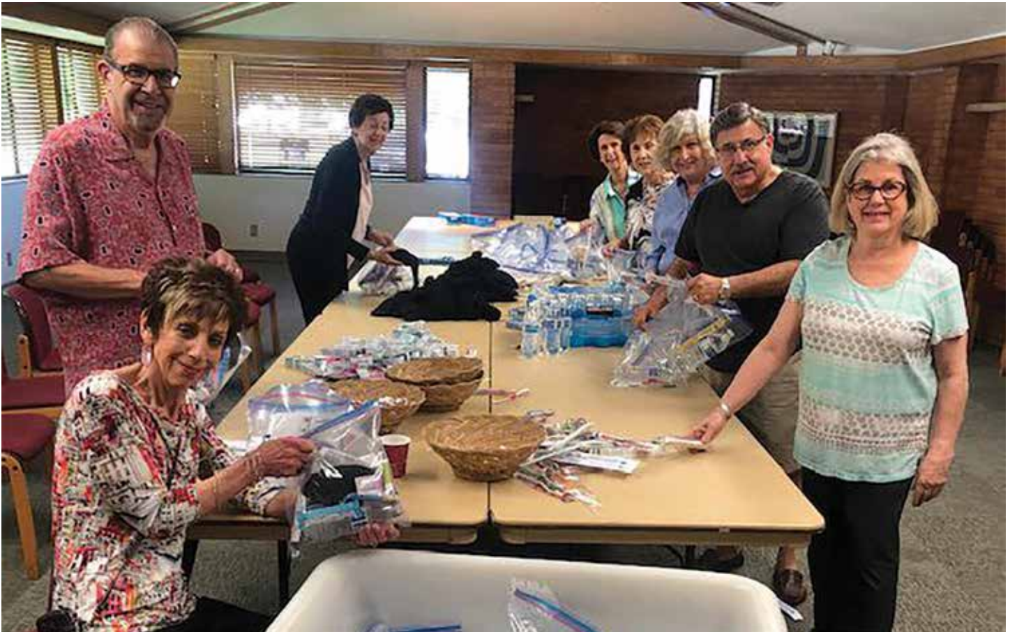
The Oshman Benevolent Fund along with the Clergy Good Works Fund enables Emanu El to host a monthly project with SEARCH Homeless Services. A group of Emanu El volunteers comes together to pack sack lunches or survival kits for Houston's homeless population.

“We are so proud that our mother designated her legacy gift to the establishment of a benevolent fund at Emanu El. She never forgot that she came to this country as a child with nothing and had little growing up. The fact that she wanted her fund to help others in need is a beautiful reflection of her values and character.”