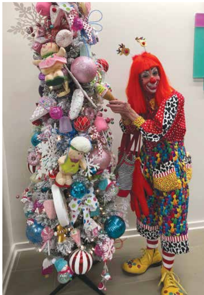
The Lillian Pasternak Mitzvah Fund has been instrumental in several on-going social action events in the community including Emanu El's annual Christmas Eve event at Ronald McDonald House. Due to COVID protocols, Emanu El will not be sending volunteers and just a meal but in prior years. In prior years, the congregation sent a team of volunteers to serve food and conduct activities. The 2018 trip included an appearance by HaHa The Clown.