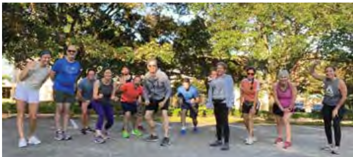
The Emanu El Running Club continues to meet weekly in the west parking lot of Congregation Emanu El on Wednesdays at 7:45 a.m.

Join a member of the Emanu El clergy and staff team as we meet up together before heading out. All paces