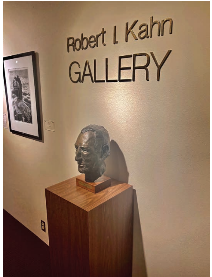
A sculpture depicting Rabbi Robert I. Kahn greets guests as they come into the art gallery. The art committee cycles exhibits through the space with the current one showcasing the various photographs housed in the Emanu El collection.