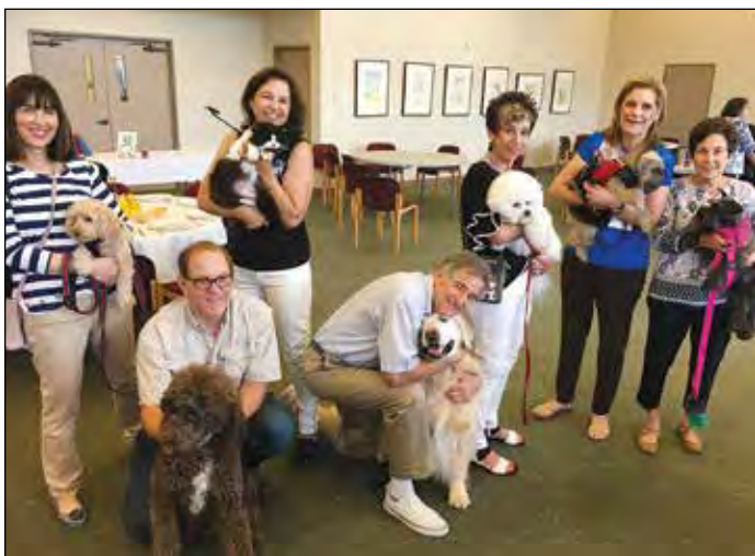
Each month, the Gathering Place is offered at Emanu El and features a program along with singing, arts, bingo, and lunch. Some of the more popular get-togethers occur when members of "Faithful Paws" and "Caring Critters" (pictured with their owners) stop by to visit with the clients and caregivers.

Emanu El has been associated with CarePartners since 1989, when the congregation launched an AIDS Care