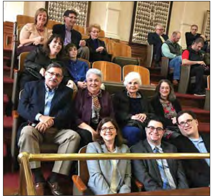
Emanu El's delegation watches the day's Texas House proceedings from the gallery of the Texas State Capitol.