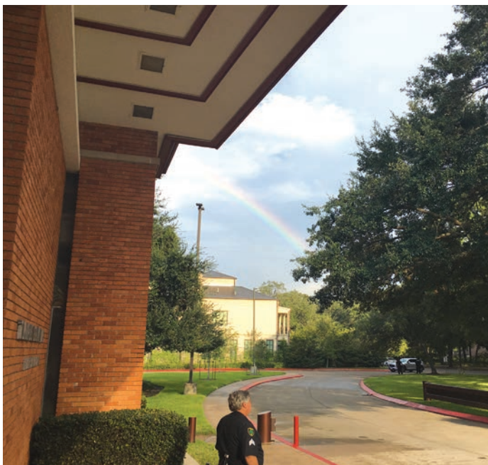
Just before Rosh Hashanah services, a rainbow appeared just outside the synagogue. A welcome sight to behold!