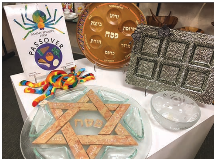
The New Traditions gift shop has plenty of Passover items on sale from Seder plates to haggadah and more! Proceeds from the sales benefit the Sisterhood and in turn, the entire Congregation.

Proceeds from purchases made at New Traditions benefit the Sisterhood. For more information, contact the Sisterhood office at (713) 529-5771, ext. 233.