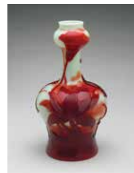
An Emile Galle vase.