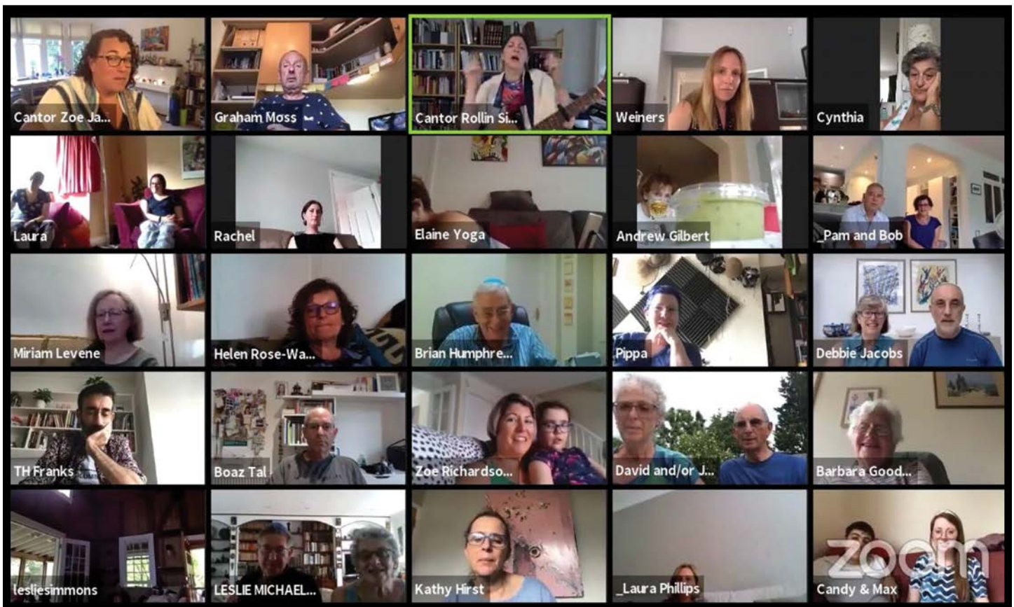
Services at Finchley Reform Synagogue by ZOOM.