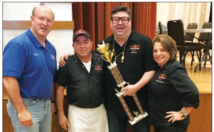
Kenny & Ziggy's restaurant won the People's Choice award at the Brotherhood's bi-annual Chicken Soup Cookoff. Kenny & Ziggy's also won top billing in the traditional category.