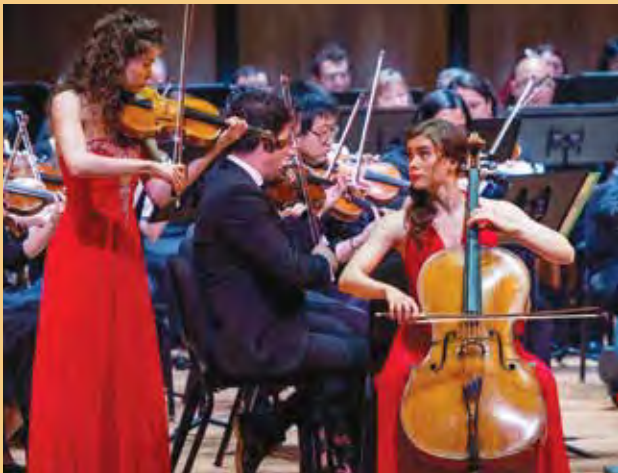
Shepherd School Of Music Concerts November 13, 2022 and February 12, 2023