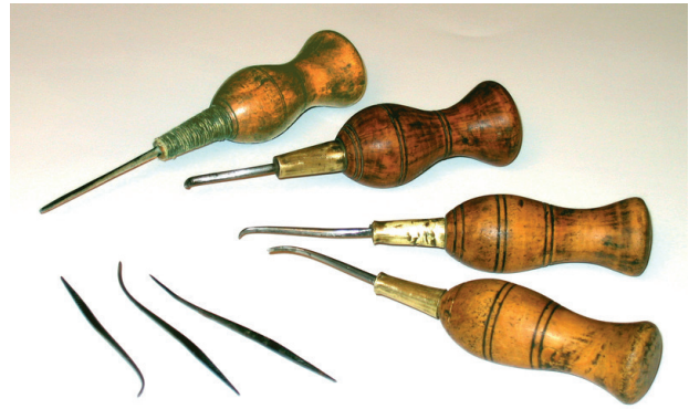
Photo 1. Different types of awls.

The woman was admitted to our clinical setting to undergo complete diagnostic procedure. On physical examination of the right hand, thenar eminence atrophy with flattening tendency, marked midcarpal ache, lack of strength in grip and opposition movements in the 1st finger, were detected. This condition, beside interfering with the patient's work capability, led to substantial limitation in performing daily activities: she was not able to button up the clothes, screw caps, do the housework and fully take care of personal hygiene. The patient worked for 30 years as a shoe upper seamstress, using a special