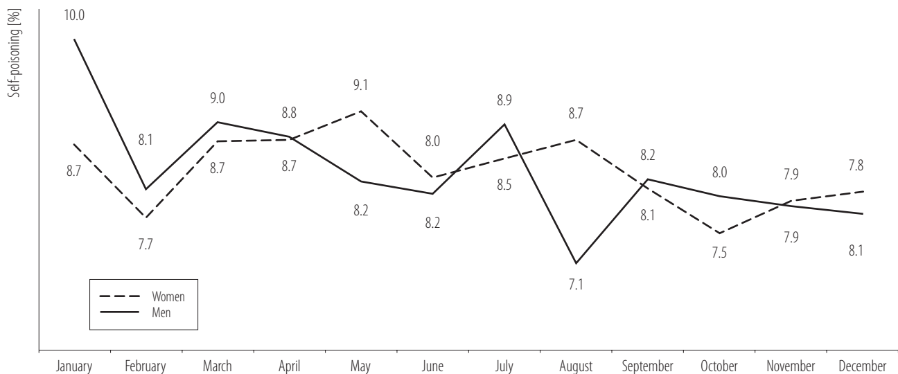
Figure 3. Frequency of deliberate self-poisonings in individual months (N = 7557) among the patients treated in the Toxicology Department of the Nofer Institute of Occupational Medicine in Łódź, Poland, in 2004–2013

group of intoxicating agents, selected by 15 men (0.48%) and 6 women (0.14%), followed by narcotics and psychoactive substances (16 men, 0.51%; 4 women, 0.09%), and gases (10 men, 0.32%; 3 women, 0.07%).