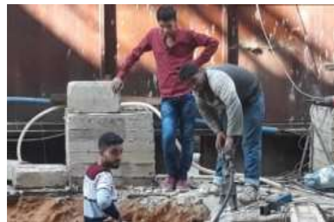
Figure 5- Workers not committed to PPE

Moreover, companies often use visual tools to define the project, project's name, owner, contractor, etc. As displayed in table (2), communication to spread safety awareness between workforces was very limited due to the poor usage of visual tools in the project sites as the mean for statement (17) in the aforementioned table shows. Most of the answers concerning VM on sites reflect the lack of using visual tools, excluding statement (9) that addresses shafts and openings where most of the engineers ensured that shafts and openings should be marked by visual tools and closed by visual barriers. It is the statement with the highest mean (4.5) where it indicates the importance of visual barriers in preventing safety accidents. Also, statements (3) and (11) ended up with an equal mean (3.5) showing that almost all sites use safety nets and keep walkways unobstructed which are major practices on site to avoid fatal accidents such as falling down from high levels or clashing with obstructing objects or materials onto walkways. Confirming to the importance of VM in safety, results align with a previous case study in Lebanon that showed the need for using visual tools to communicating important safety instructions as a key for maintaining a safe environment on construction sites (Awada et al., 2016).