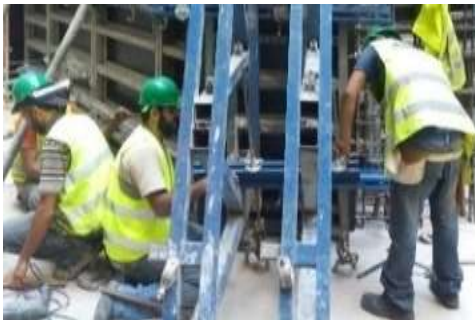
Figure 4-Workers commitment to PPE visual indicators