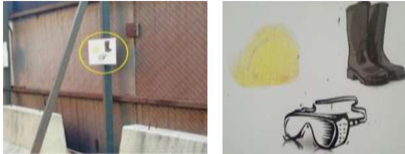
Figure 3- PPE clearly displayed

confirms the importance of having visual tools on construction sites to encourage workers to follow safety regulations and thus reduce accidents. Furthermore, both statements (5) and (6) show very low means, 2 and 2.33 respectively, and this is due to the absence of visual indicators and regulations that force, encourage, and remind the workers of the PPE whenever they are on site, whether inspecting or performing the work.