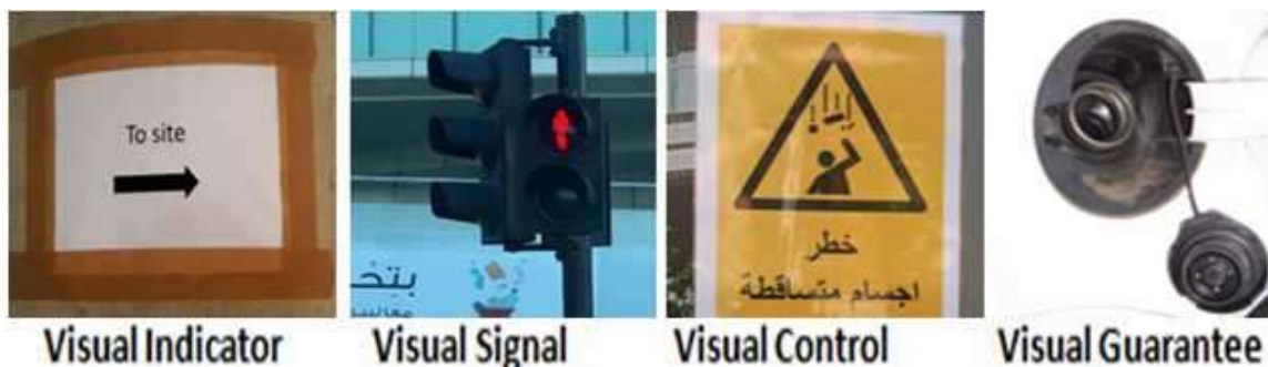
Figure 1- The four types of Visual Tools inspired from (Tezel, 2015)

Figure 1 shows the four different types of visual tools used on different sites in Lebanon