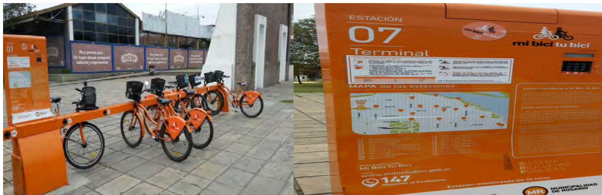
Figure 4.2. Docking Station n.7 “Terminal” of the Bike-Share System in Rosario

4.6 Bike-share users need first to register, either in person or on line. A mobile phone application, the “My Bike Your Bike” (Mi Bici Tu Bici), can be downloaded and is available to users to show the availability of bicycles and docking stations in real time. Registrations can be for a month or a year. The fee structure is based on the price of the bus ticket and is designed to encourage long-term registrations. Students and working people with age of 35 or less are eligible for a 50 percent discount.