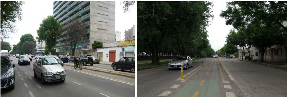
Figure 4.1. New Bikeways in Rosario

4.4 Bus Rapid Transit system in Posadas: The GEF Project funded the final design for a 3.2 km bus rapid transit system on Avenida Uruguay of the city of Posadas. The civil works were expected to be financed with other sources of funding. 11 However, this project has not yet been implemented, in part owing to the opposition of important retailers on Avenida Uruguay, and it is not clear at the moment when in the foreseeable future the public works will be initiated.