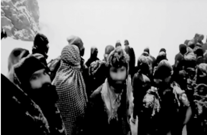
Photo taken by a migrant depicting severe weather conditions in the Zagros mountains on the Iran-Turkey border