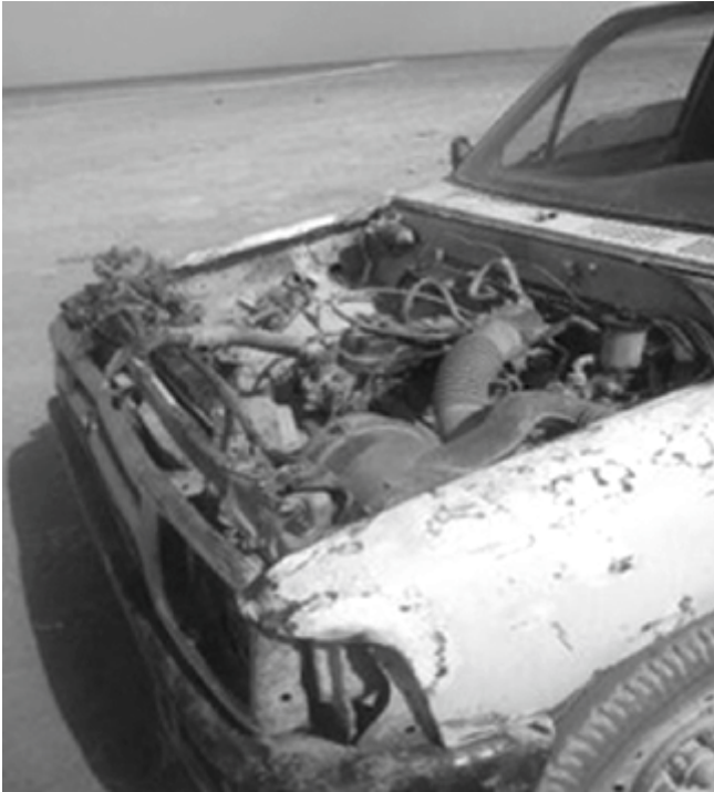
The condition of a zambad transporting migrants from Quetta to Mashkel

From here, a highly dangerous journey started that took them across Balochistan, from Quetta through Duk, further through Siahpat and onwards to Mashkel. The entire stretch of land was as barren as it was dark.