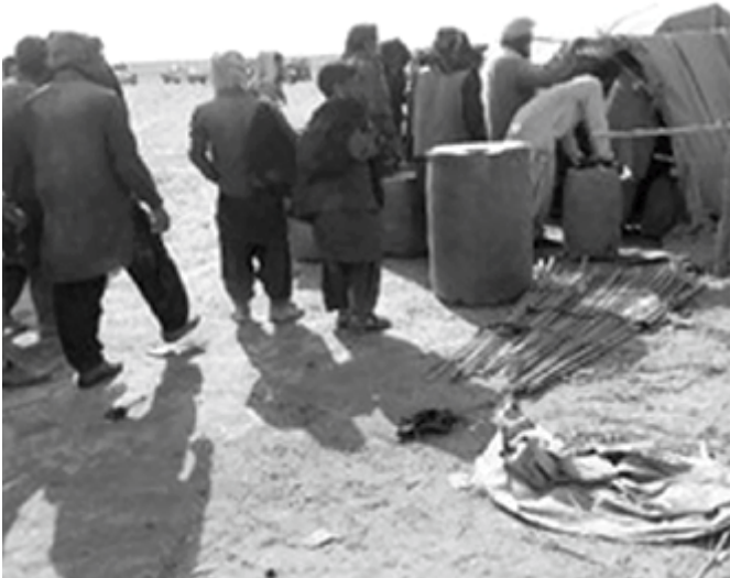
A group of migrants lining up to purchase water during their journey

Mahmood and the rest of his cohort reached Mashkel where they purchased water and food at exorbitant prices. From Mashkel, the migrants were to cross the mountains bordering Pakistan and Iran on foot. The group, which according to Mahmood comprised mostly men in their early twenties, started the long walk.