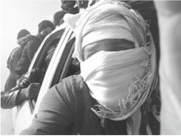
A large group of migrants packed into a single vehicle

Mahmood and the rest of his cohort reached Mashkel where they purchased water and food at exorbitant prices. From Mashkel, the migrants were to cross the mountains bordering Pakistan and Iran on foot. The group, which according to Mahmood comprised mostly men in their early twenties, started the long walk.