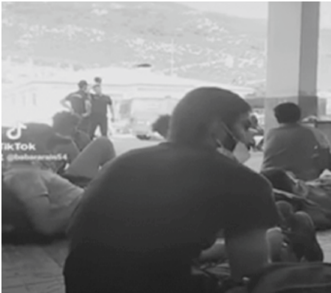
Screengrab of a video shot by a migrant of a camp where they were moved after their boat was seized in the Mediterranean