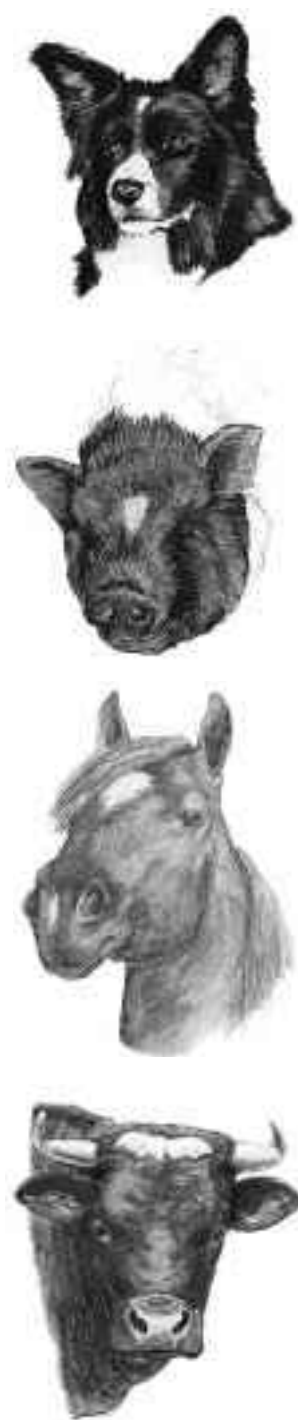
Figure 3. Piebald coat color is one of the most striking mutations among domestic animals. The pattern is seen frequently in dogs (border collie, top right), pigs, horses and cows. Belyaev's hypothesis predicted that a similar mutation he called Star , seen occasionally in farmed foxes, would occur with increasing frequency in foxes selected for tamability. The photograph above shows a fox in the selected population with the Star mutation.

ging their tails and whining. In the sixth generation bred for tameness we had to add an even higher-scoring category. Members of Class IE, the "domesticated elite," are eager to establish human contact, whimpering to attract attention and sniffing and licking experimenters like dogs. They start displaying this kind of behavior before they are one month old. By the tenth generation, 18 percent of fox pups were elite; by the 20th, the figure had reached 35 percent. Today elite foxes make up 70 to 80 percent of our experimentally selected population.