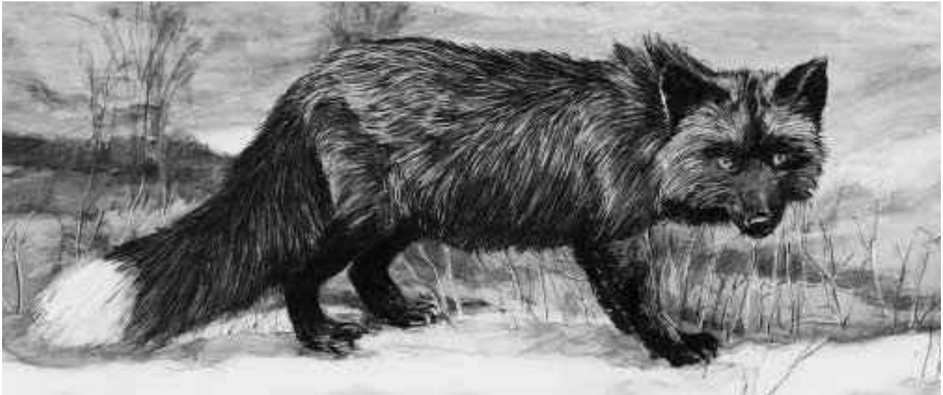
Figure 4. In typical silver foxes, such as those in the founding population of Belyaev's breeding experiment, ears are erect, the tail is low slung and the fur is silver-black, save for the tip of the tail. (All drawings of foxes were made from the author's photographs.)

tion, snarling fiercely at one another as they seek the favor of their human handler. Over the years several of our domesticated foxes have escaped from the fur farm for days. All of them eventually returned. Probably they would have been unable to survive in the wild.