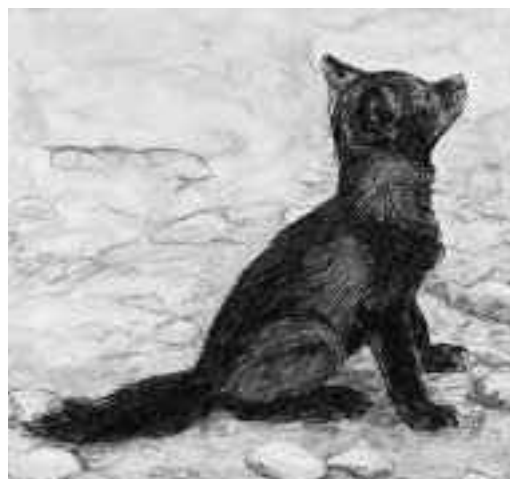
Figure 7. Changes in the foxes' coat color were the first novel traits noted, appearing in the eighth to tenth selected generations. The expression of the traits varied, following classical rules of genetics. In a fox homozygous for the Star gene, large areas of depigmentation similar to those in some dog breeds are seen ( top ). In addition some foxes displayed the brown mottling seen in some dogs, which appeared as a semirecessive trait.

tion. Fur farmers have tried for decades to breed foxes that would reproduce more often than annually, but all their attempts have failed.