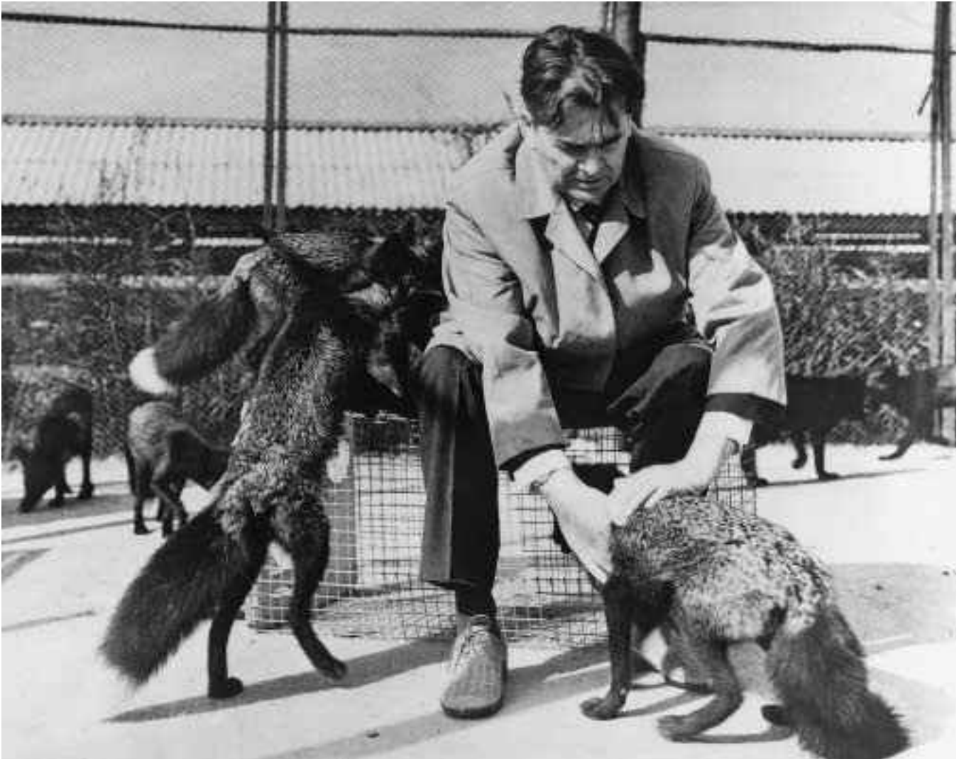
Figure 1. In the late 1950s, the Russian geneticist Dmitry K. Belyaev began a decades-long effort to breed a population of tame foxes. Belyaev, then director of the Institute of Cytology and Genetics of the U.S.S.R. (now Russian) Academy of Sciences in Novosibirsk, Siberia, hoped to show that physical and morphological changes in domestic animals such as dogs could have resulted from selection for a single behavioral trait, friendliness toward people. Fourteen years after his death, the experiment continues, and the results appear to support Belyaev's hypothesis.

that might well explain why different animals would respond in similar ways when subjected to the same kinds of selective pressures.