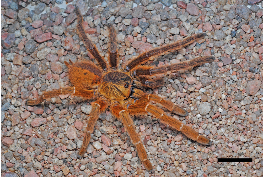
Figure 1.—Gynandromorph of Pterinochilus murinus . Habitus, dorsal view, scale: 200 mm.