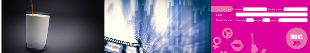
Figure 1: Examples of motion graphics in education (left), advertising (middle), and UI onboarding (right).

School of Computing Science, Simon Fraser University