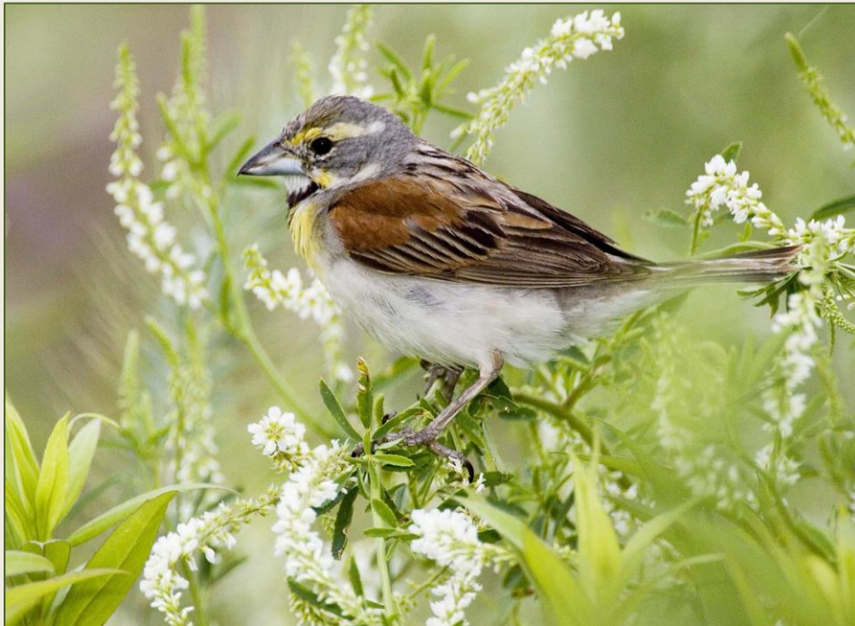
Dickcissel