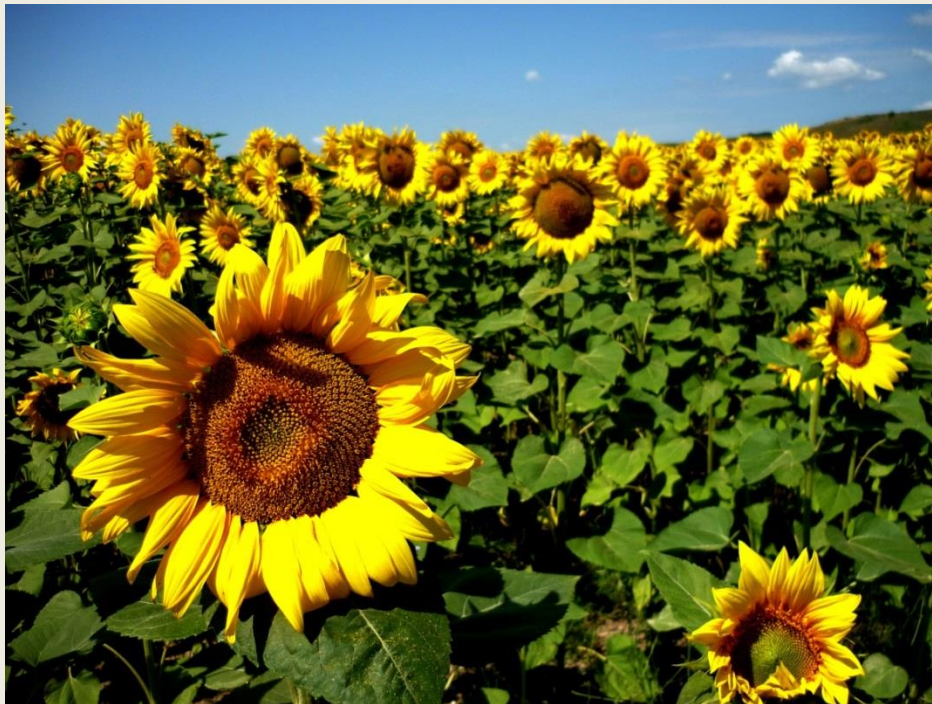
Sunflower field