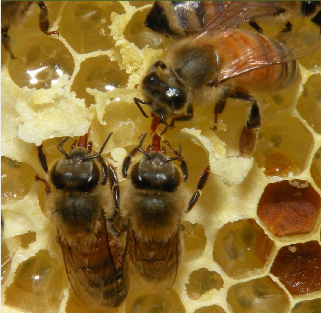
Honeybees

taken from streams in southern Ontario draining either urban or rural areas, the latter being either orchard-dominated or field-crop dominated. The data are summarised in Table 7.13. 23