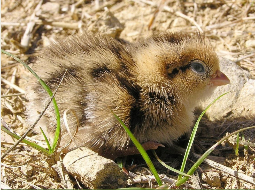
California Quail chick