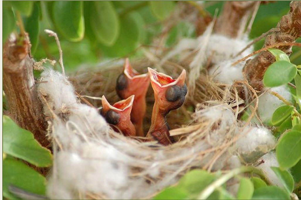
Altricial chicks