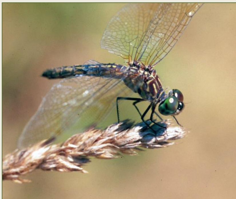
Dragonfly on wheat

A species sensitivity distribution based on the normally distributed acute data returns an HC5 of 1.01 ug/l for crustacea (0.06-6.8) and an almost identical 1.02 ug/l for aquatic insects (0.31-2.06). Despite the overlap, the insects appear to have a much lower sensitivity variance – i.e. more similarity in response. A pulse of imidacloprid in the ug/l range would therefore be expected to affect a larger proportion of the insect community.