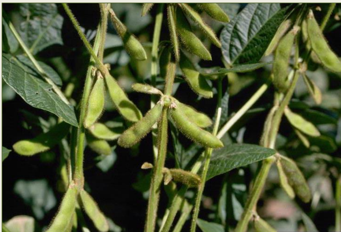
Soybean plants