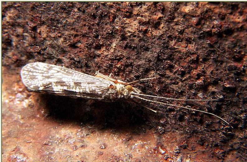
Caddisfly