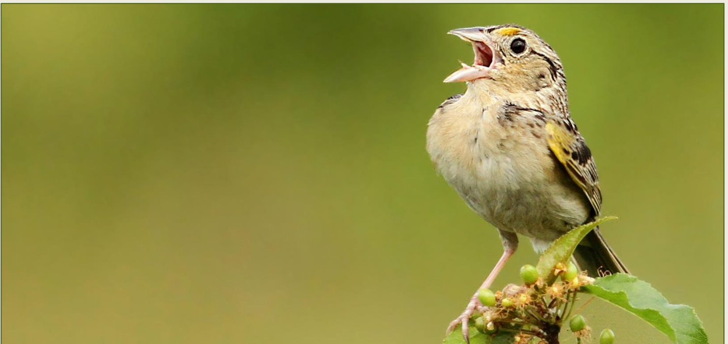
Grasshopper Sparrow