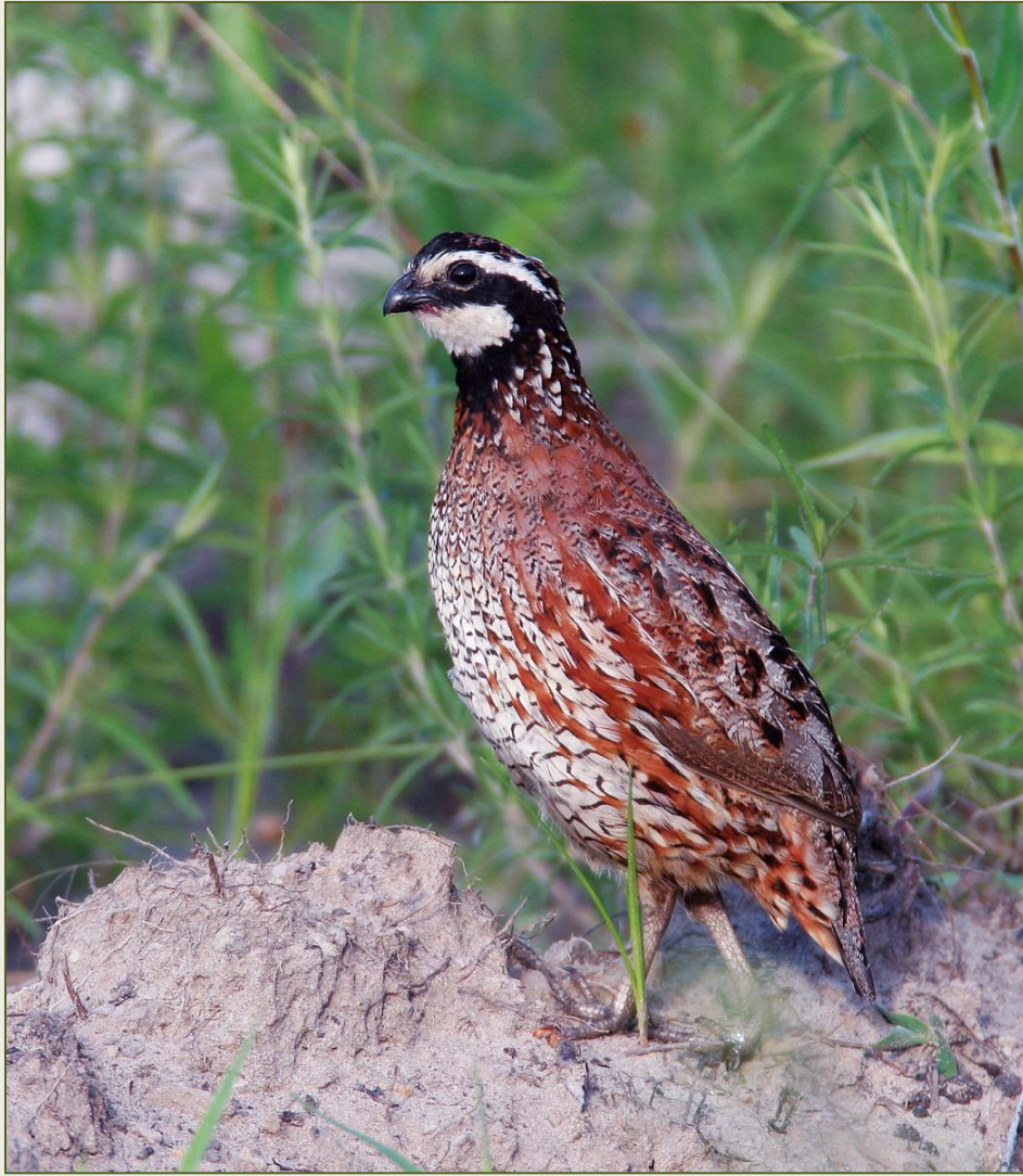
Northern Bobwhite