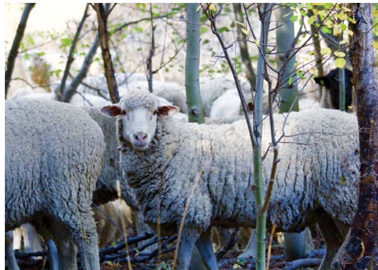
Pioneer Mountains, Idaho.

With planned-rest grazing, in contrast to spreading livestock broadly across the ranch or allotment, livestock are concentrated on a portion of the ranch for a time and moved periodically to fresh forage, thereby providing periods of plant recovery between grazing episodes. Several contributors managing livestock in large carnivore habitat (particu-