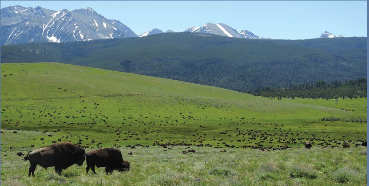
Photo: Flying D Ranch, Montana