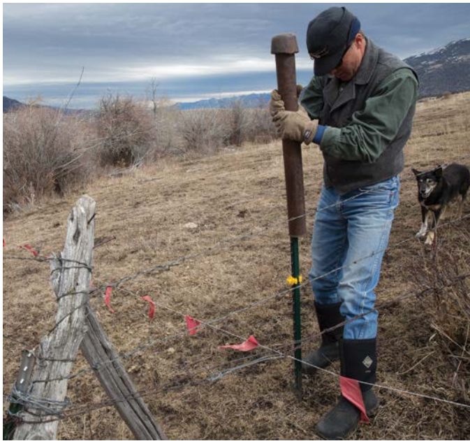
Anderson Ranch, Montana.