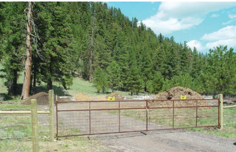
Compost pile.

Conflict management strategies for smaller acreages include removing or fencing predators away from attractants (such as carcasses, livestock or crops) and a variety of nonlethal predator deterrents (Bangs et al. 2006, pp. 7–16). Nonlethal deterrents generally include loud noises or electric shock, or they are designed to exploit predators' fear of and tendency to avoid human activity and