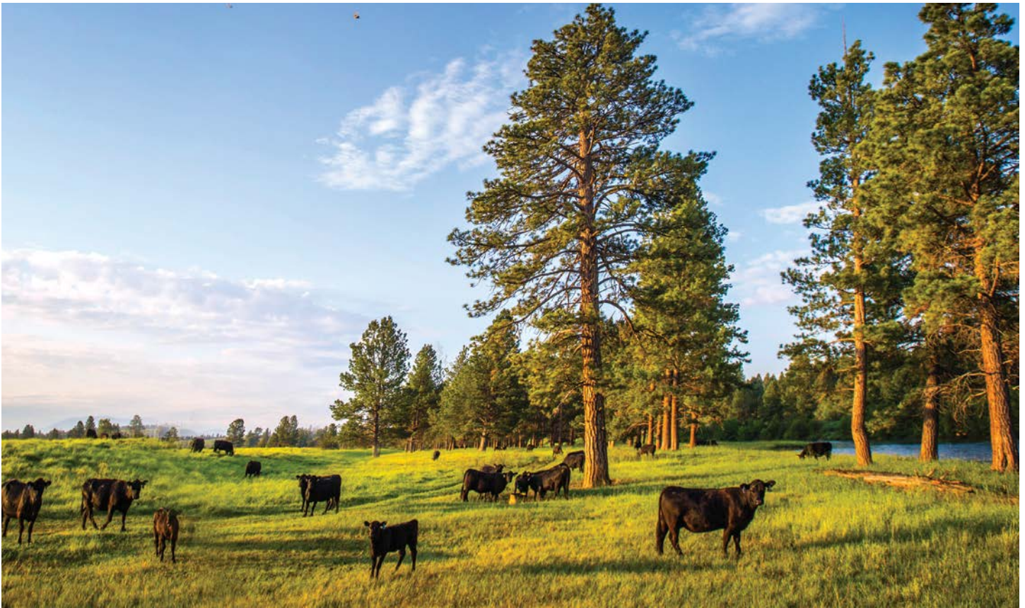
Mannix Brothers Ranch, Montana.

For dispersal hunts to be successful, there must be suitable areas for elk to move to, away from conflict areas. Contributors identified a need to identify adequate elk winter-spring ranges and fund habitat management to attract and hold elk.