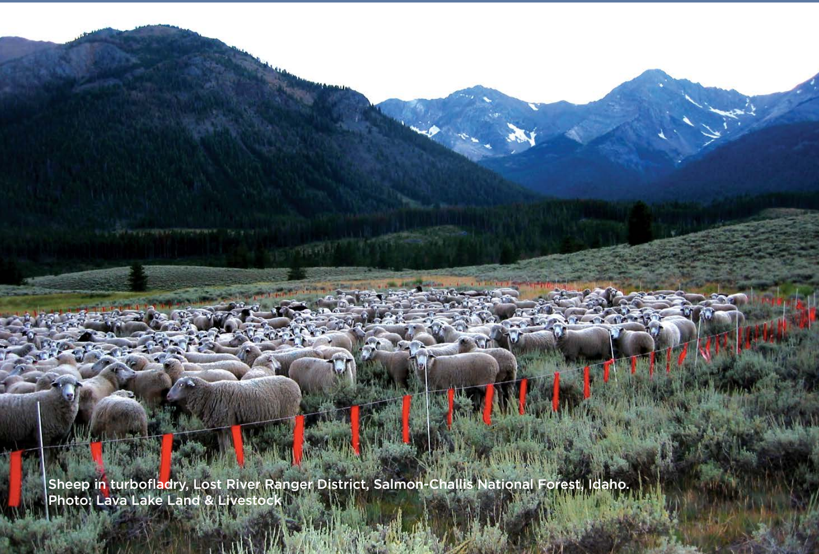
Sheep in turbofladry, Lost River Ranger District, Salmon-Challis National Forest, Idaho.

He also points out that wolves tend to drive out, suppress or kill coyotes in wolf range.