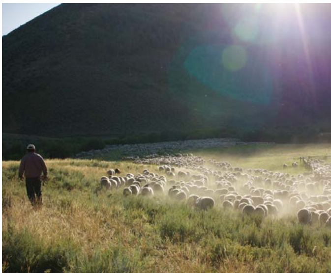
Ketchum Ranger District, Sawtooth National Forest.

In the Rocky Mountains, grazing sheep have routinely been tended by herders living with a social