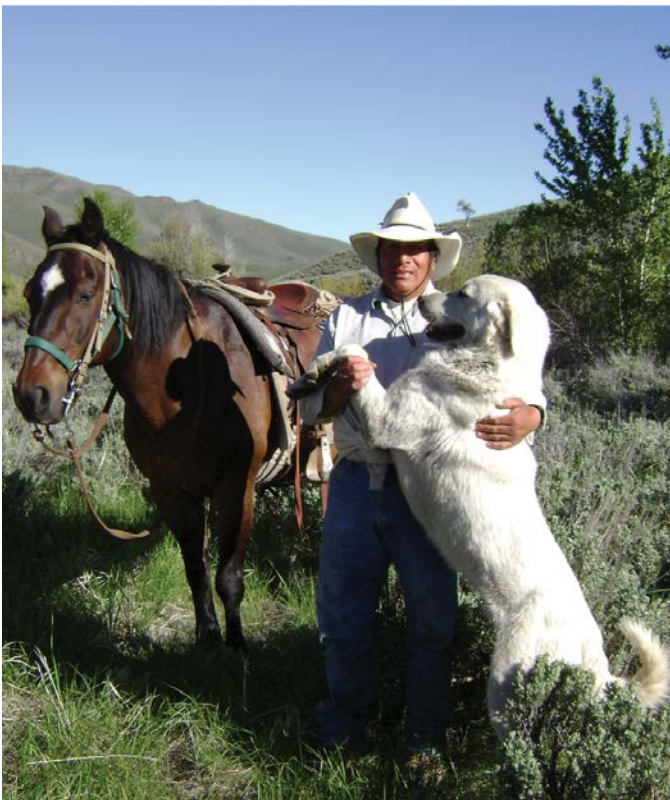
Livestock guardian dog and herder, Blaine County, Idaho.

State and federal agencies are also a good source of assistance. Livestock depredation compensation programs are available in most western states, funded through either the state wildlife agency or the state agriculture agency. Sources of information on compensation, predator deterrent cost-share programs and other conflict reduction programs are listed in Appendix 3.