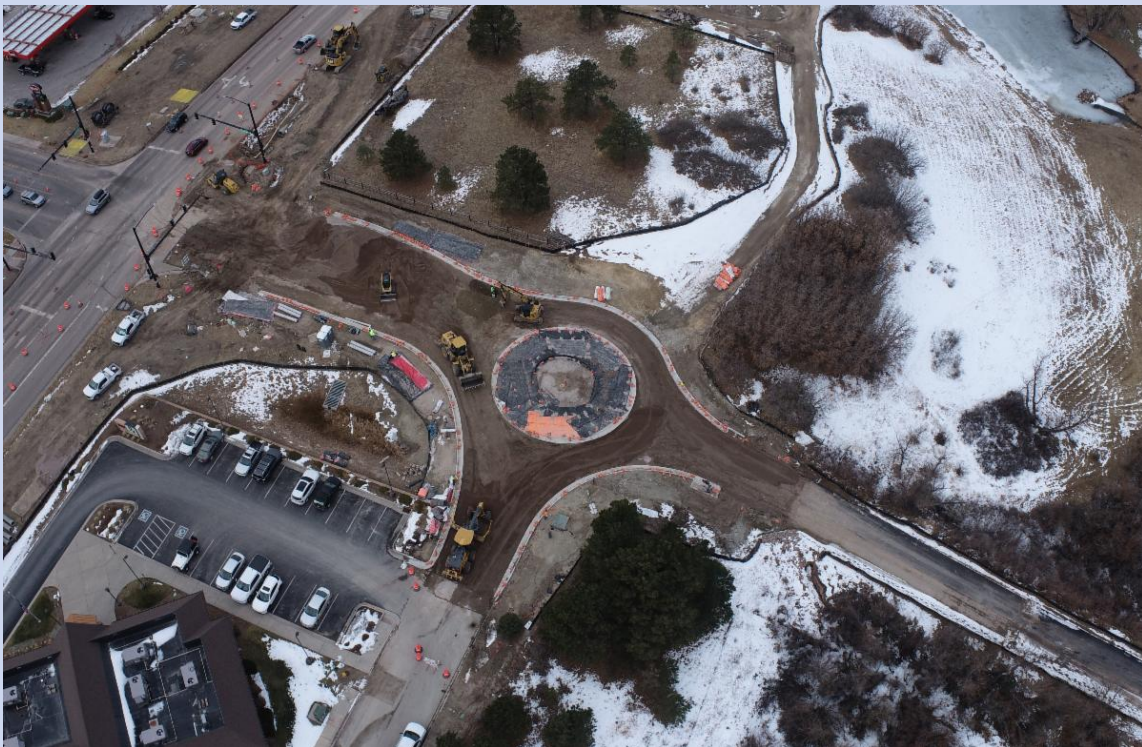
Progress photo of new roundabout at Knollwood and Village Ridge Point

The temporary paved access to Village Ridge Point off of Hwy. 105, just east of Integrity Bank, will be closed, and the temporary traffic signals at the intersection of Hwy. 105 and Morning Canyon/LDS Church will be removed during the week of Dec. 25, 2023. They are only in operational Signal mode on Sundays at this time and will be removed soon after Christmas Day. Businesses on Village Ridge Point and Monument Academy school traffic will enter and exit along Village Ridge Point at Knollwood as they did prior to construction.