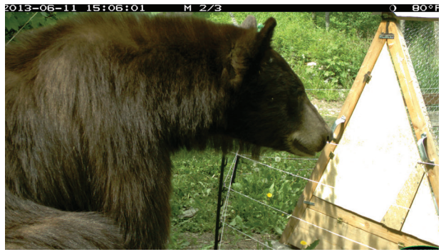
A black bear is about to find out that this chicken coop is protected by a newly installed electric fence.