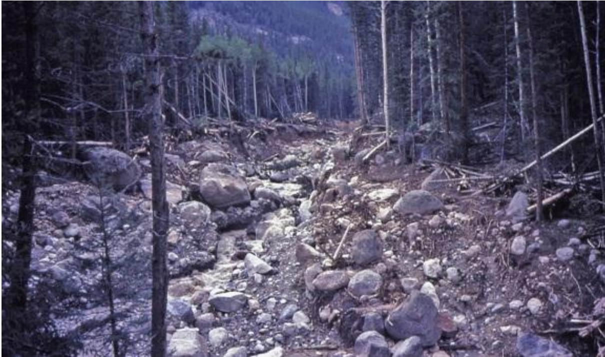
Figure 5: Roaring River erosion