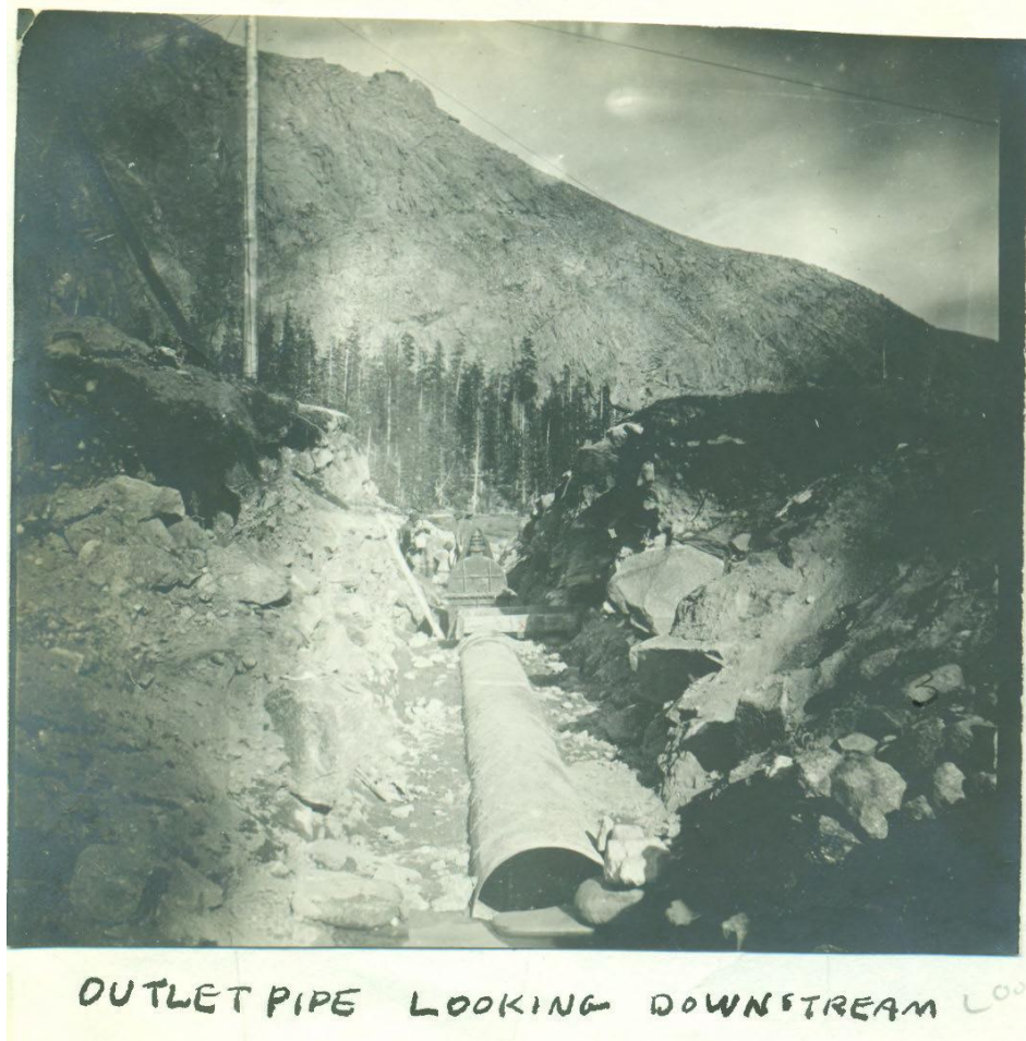
Figure 1: View of outlet in notch in moraine, 1903 photo (State Engineers Office (SEO) file).

The design specified that the valve be encased in concrete. However, this was not done. The completed dam was effectively 19 feet high and stored 498 acre-feet of water.