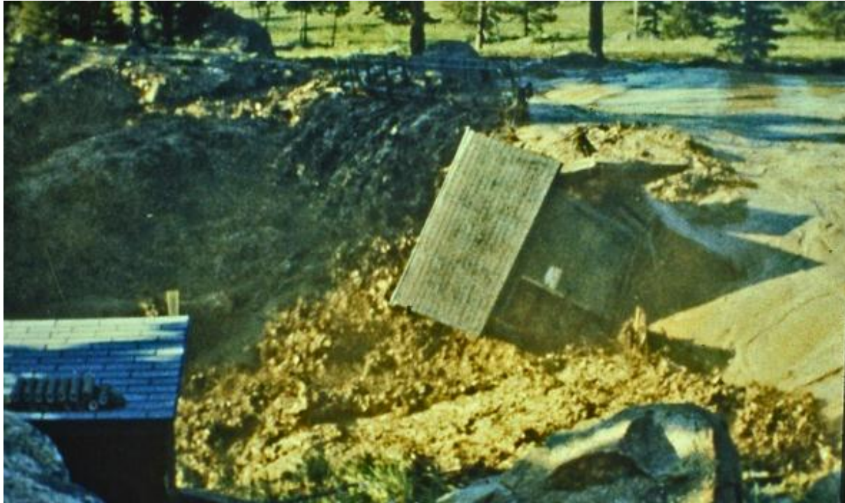
Figure 7: Cascade Dam in process of breaching

The flood then destroyed the State fish hatchery, a small hydropower plant, bridges and cabins/cottages along the Fall River. At about, 8:15AM, the debris-laden flood entered the town of Estes Park. The flood was up to 6-feet-deep down Main Street in Estes Park and later the peak flow was calculated to be 6,000 cfs (1) . Flooding deposited mud in 177 town businesses, inundated a total of 108 residences, and destroyed thirteen bridges (6) . The flood waters entered Lake Estes and were contained by the Bureau of Reclamation's Olympus Dam. By 9:30 a.m. the flooding had passed, leaving behind damages estimated to be $31 million.