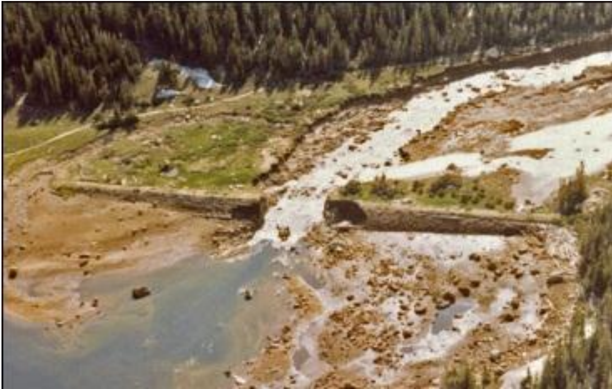
Figure 4: Aerial view of the dam breach

At the confluence of the Roaring River and the Fall River, the flood dropped its load of boulders and trees onto the relatively flat Horseshoe Valley. This created an alluvial fan 42 acres in size and up to 44 feet deep (1) . A man driving his truck into Horseshoe Valley to empty trash barrels at a trail head witnessed the flood and called NPS dispatch. After flowing out of Horseshoe Park, the flood continued down Fall River filling Cascade Reservoir until it overtopped its 17-foot-high, concrete gravity dam. After about 40 minutes of overtopping, Cascade dam toppled, sending a new surge of water (estimated to be 16,000 cfs) downstream (1,4) .