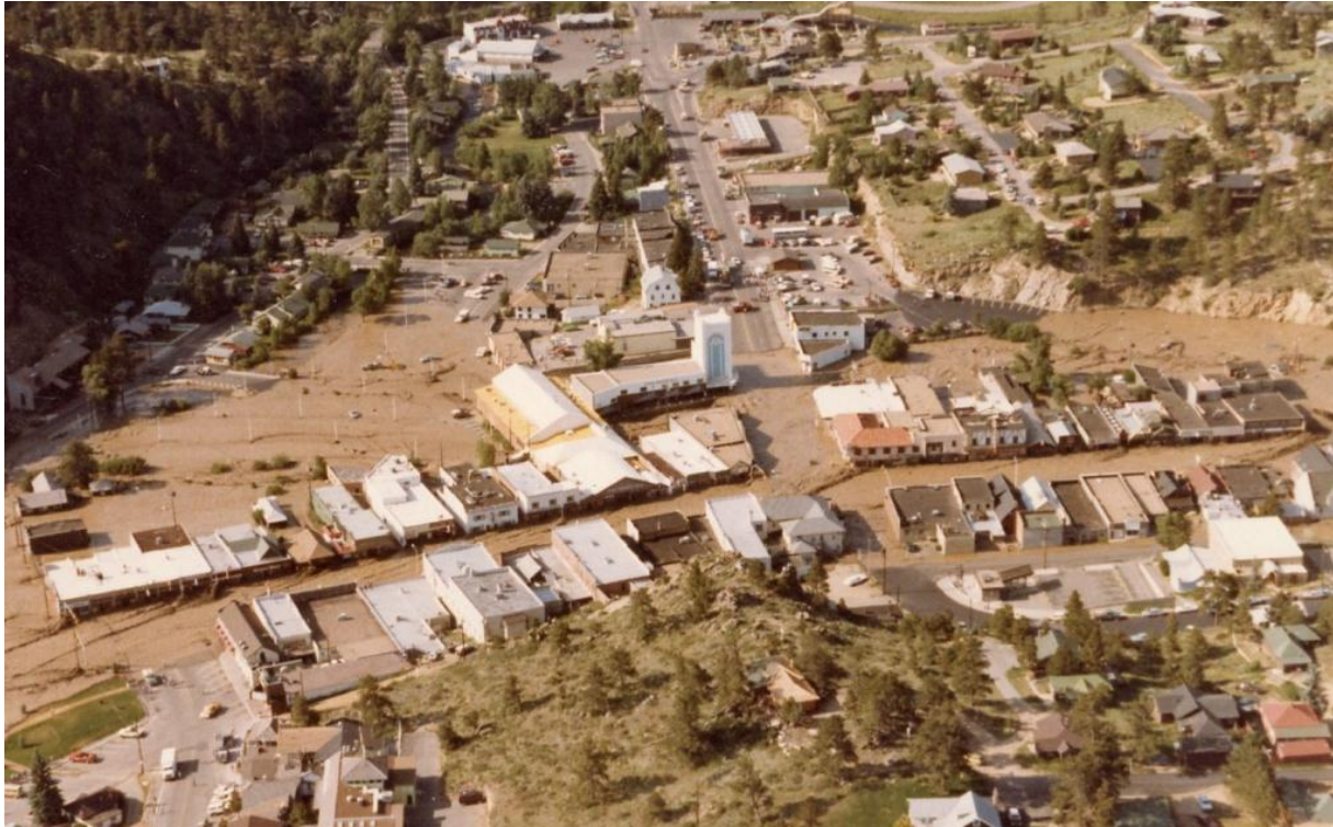
Figure 8: The Dam failure flood moving through downtown Estes Park at depths of up to 5 feet.

The initial priority for the NPS was saving lives. During the flood, park rangers monitored the flood and blocked roads. They also warned people in Aspenglen Campground and assisted Larimer County with warning and evacuation.