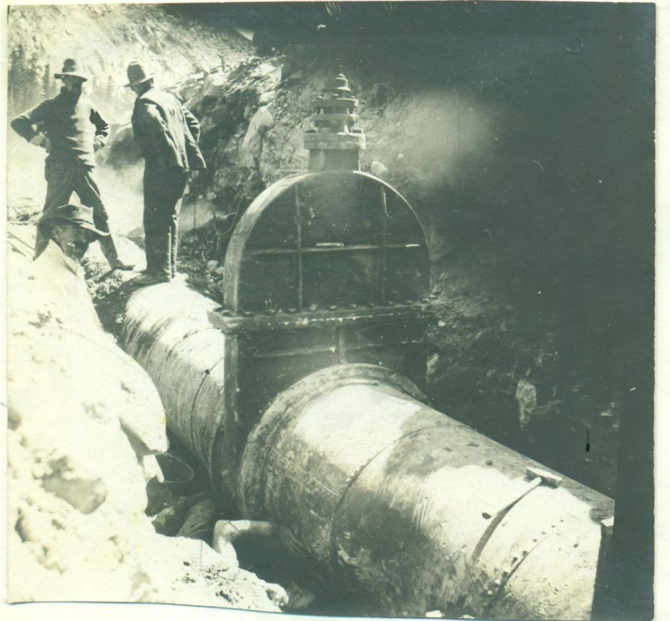
CAULKING PIPE INTO UPPER FACE OF VALVE.