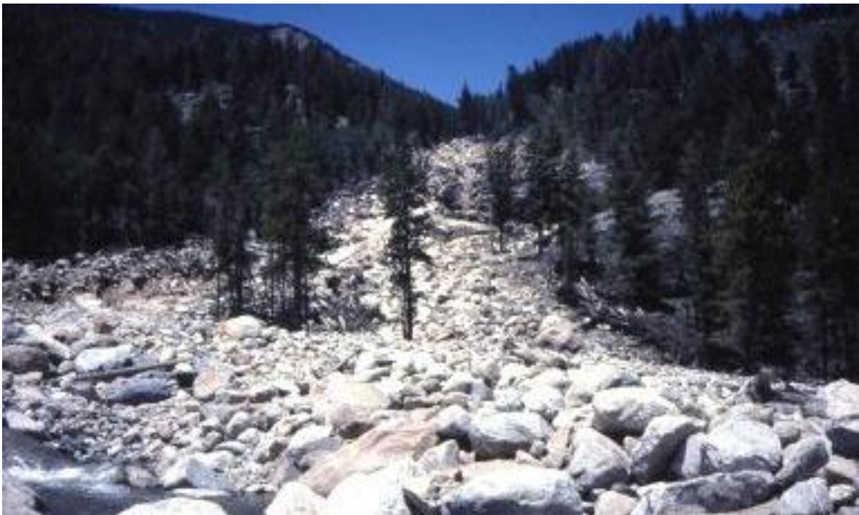
Figure 6: Alluvial fan at confluence of the Roaring River and the Fall river.