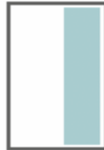
1/2 page vertical 3.5" x 9.75"