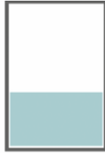
1/2 page horizontal 7.25" x 4.75"