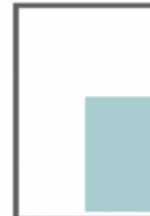
1/2 page "island" 7.25" x 4.75"