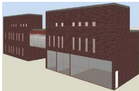
Fig. 2. Model of educational facility.

In order to evaluate the effect of both U_u and U_o on building energy consumption, simulations were carried out on a model building, using the U -values of the building cases in this study as the U -value of the building envelope. The model building (see Fig. 2) is a 2-storey educational facility with total floor area of 466.02 m 2 and gross wall area of 730.61 m 2 . It was assumed that the model building was situated in Seoul, South Korea. Thus hourly weather data of