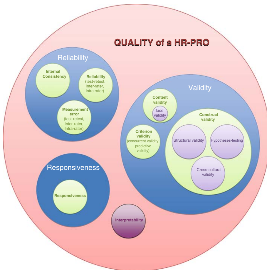
Fig. 1 COSMIN taxonomy of relationships of measurement properties

In the Delphi study, we also developed a taxonomy of the relationships of measurement properties that are relevant for evaluating HR-PRO instruments, and reached consensus on terminology and definitions of these measurement properties. The relationships between all properties are presented in a taxonomy (Fig. 1). The taxonomy comprises three domains (i.e. reliability, validity, and responsiveness), which contain the measurement properties. The measurement property construct validity contains three aspects, i.e. structural validity, hypotheses testing, and cross-cultural validity. Interpretability was also included in the taxonomy and checklist, although it was not considered a measurement property, but nevertheless an important characteristic. The percentages agreement on terminology and position in the taxonomy are described elsewhere [12].