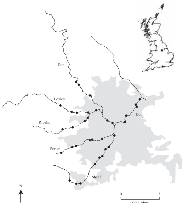
Figure 1. The urban area of Sheffield, United Kingdom, (shaded) showing the major rivers running through the city (solid lines) and study sites (filled circles). The inset shows the location of Sheffield in Britain.

Bird, butterfly, and plant species richness were surveyed at each site. Using standard protocols, bird surveys were carried out on two separate occasions at each site between 29 March and 26 June 2009, with the second at least six weeks after the first. To ensure that the maximum number of species was encountered, the visits began between one and three hours after sunrise, when a five-minute point count was performed, and the identity of each bird was noted. A list of all species recorded at each site during both surveys was compiled. Centered on the avian point-count location, and running parallel to the riverbank, a 40 × 10 meter (m) area was actively searched for butterflies for a fixed time period of 15 minutes. The sites were visited three times (in late May or early June, in July, and in August), and a list of