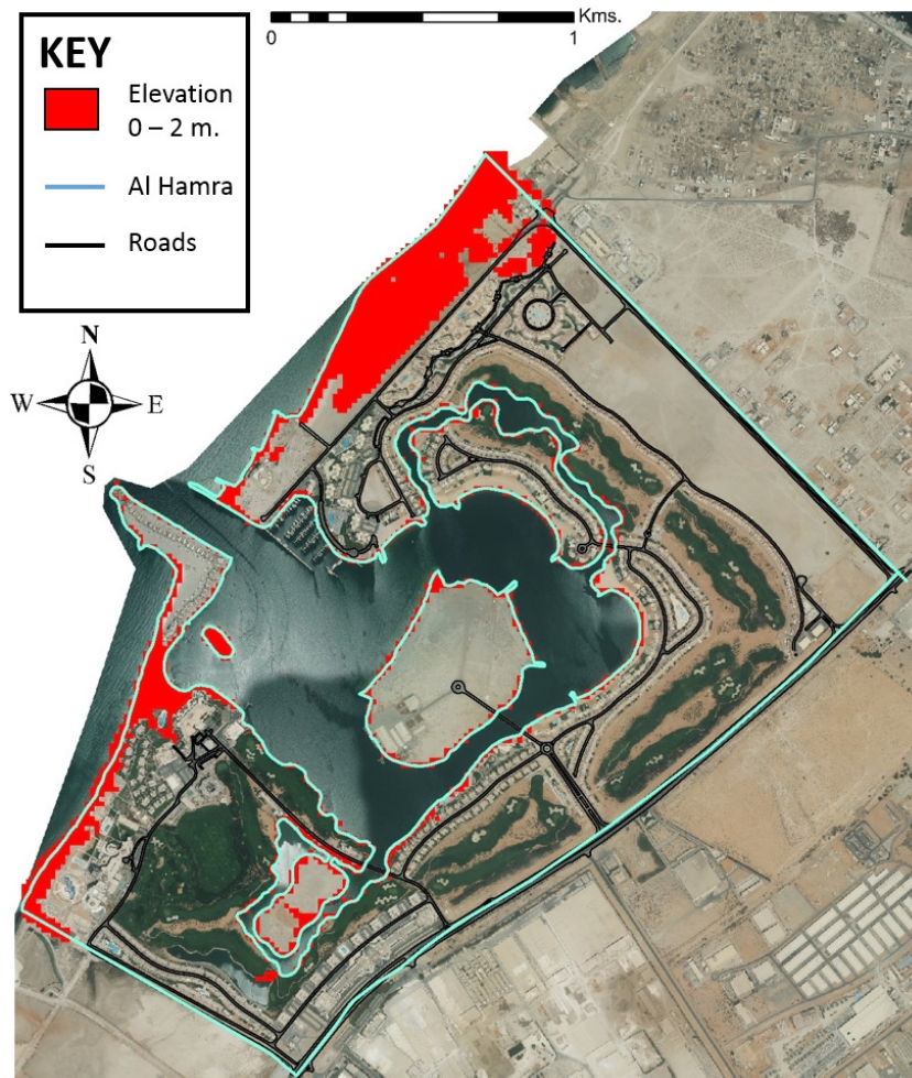
Figure 3. Inundation Map for the Al Hamra Development