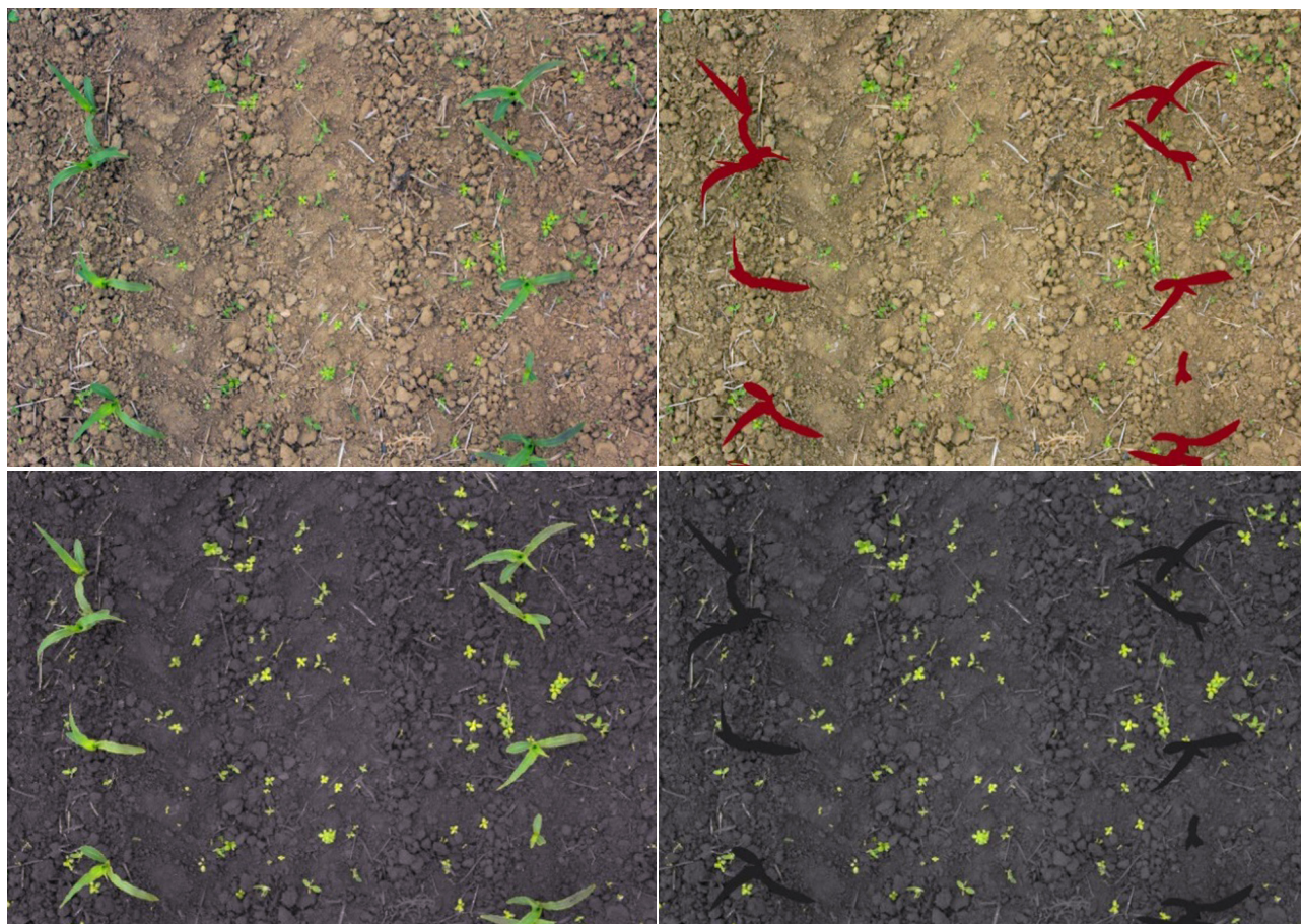
Figure 1 Input images (top row) including and excluding corn plants from the green fraction analysis and the equivalent output images (bottom row) from the Breedpix software. Example shown for plot 14 (image 14_3), sampling date May 18, 2015

The BreedPix software is an easy-to-use application for image analysis. The images located in the same folder are loaded into the software as a content of an image list.