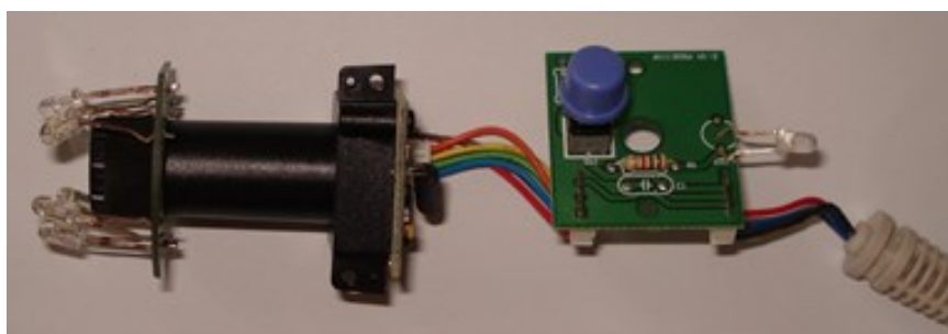
Figure. 1 The modified microscopic camera

The experimental measuring was made on the corn grains, which was manually ground from the corn cobs (in order not to damage them by working operation - threshing), later the corn was moistened for desired humidity in the desiccator. Later it was dried inside of the laboratory dryer and the micro-damage was performed using to the CCD camera. The evaluation of the corn grain micro-damage was performed using a machine, which consists of two main parts. It is a machine which contains a video recording device, in our case, we used TV card Lifeview – Fly DVB-T Card Bus DUO (DVB-T Duo is a product which enables displaying both digital and analog signal, thanks to PCMCIA card), and a modified microscopic camera. The analog camera has 100x zoom (Fig. 1). We can connect it to a TV, but we can also use a TV card or a grabber and connect it directly to a PC. Integrated LED always allows optimal lighting of examined objects. The result of the research is in the figure number 2.