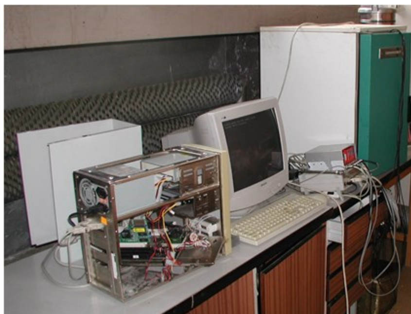
Figure. 3. View on the measuring equipment

The micro-damage evaluation itself was predated by drying and dry material temperature observation (Fig. 3). The equipment consisted of temperature sensors Pt1000, A/D converter MA-UNI with amplifier and a datalogger with measuring card iM 1610 from BMG Group company.