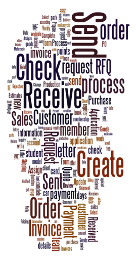
Fig. 3: Example word cloud.

A word cloud visualizes the distribution of words in a large set by their size printed on a canvas; an example is depicted in Fig. 3.