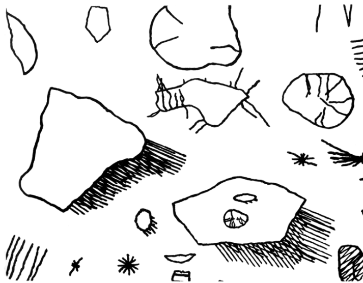
Detail from Drawing for Machine and Four Hands, by Harold Cohen, a 14' × 40' mural in existence for three weeks at the University of California, San Diego, May 1976.

We may again paraphrase this by using terms like artefact and description to characterize our topic of the boundary. From description to artefact would then be the act of form-generation. Form-generation is here viewed as a transformation of the description into the appearing artefact, from the virtual to the actual form. The other direction, from artefact to description is, of course, an act of interpretation.