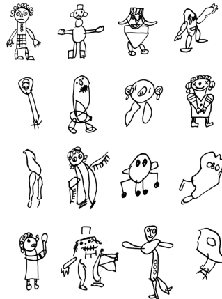
Fig. 1. Children’s drawings of humans: open and closed shapes (from [2])

When we say “shape”, we may be thinking of mathematics or art, design or philosophy. Today, we may also be thinking of computing science. We certainly do so when the announcement says “Shapes 1.0”. The particle “1.0” in the title of this meeting announces nothing but: this is, in some way, the first of a kind. But the innocent particle also defines a specific context, the context of versioning. The very moment, the organizers seem to be telling us, that we prepare for a first meeting, we declare it to be the first and thus a succession is needed or else we have failed. The particle “1.0” in the name of this meeting is a form-particle.