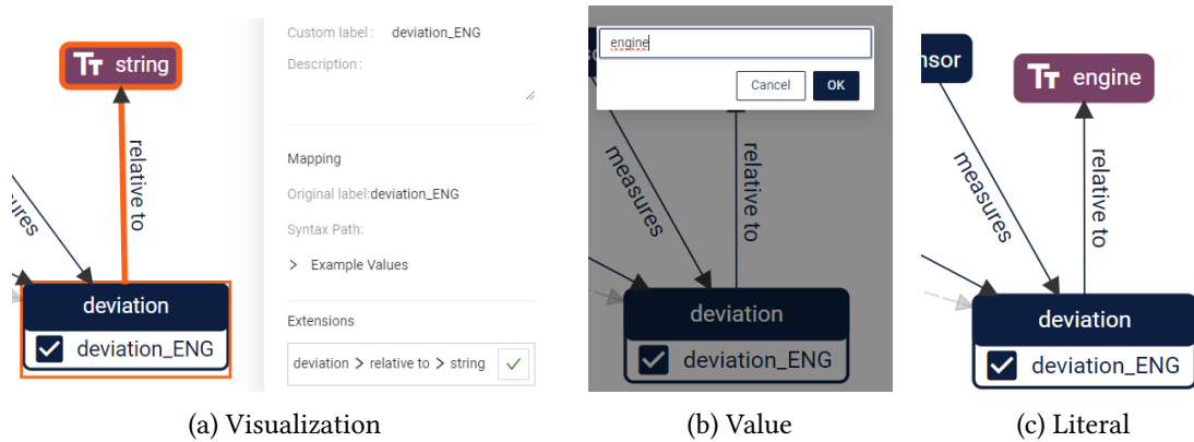
Figure 3: Recommendations in the PLASMA modeling interface

indicated, but at the same time, a matching formalization is proposed.