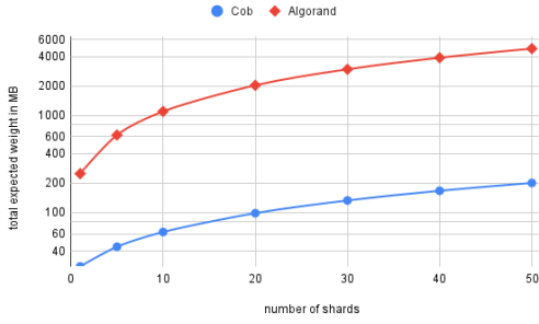
Figure 1: Amount of data broadcast in the network (in MB) using Algorand or Cob during the last time-slot of each epoch, in terms of the number of shards. Linear scale in the x-axis and logarithmic scale in the y-axis.