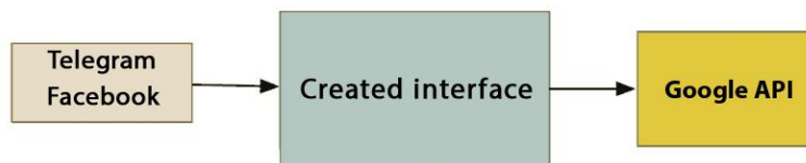
Fig. 1. The simplified representation of created system

The decision to use Google Speech-to-Text API was made because Google provides clear documentation, with great examples of API features and they fully satisfied request of 100% uptime, reliability and has a lot of supporting languages, so it helps to make the product interesting for more people.