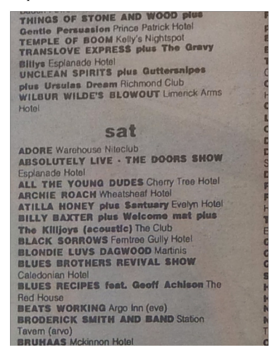
Figure 1: Examples of gig listings