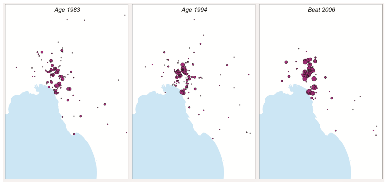
Figure 3: Melbourne maps of performance listings by venue, 1983, 1994, 2006

Table 3 and Table 4 present descriptive statistics of live music performances in Sydney, drawn from samples of gig listings from the Sydney Morning Herald and Drum Media respectively. These can be compared to the equivalent publications for Melbourne presented in Tables 1 and 2.